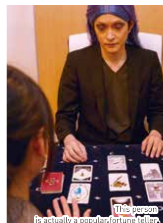
This person is actually a popular fortune teller.