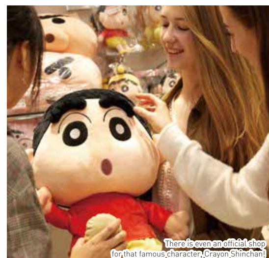
There is even an official shop for that famous character, Crayon Shinchan!