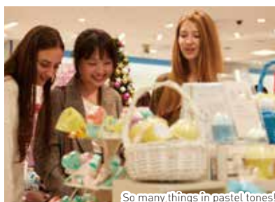
So many things in pastel tones!