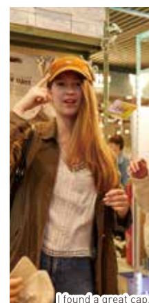
I found a great cap.