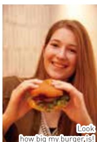
Look how big my burger is!