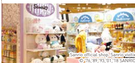
Sanrio official shop, Sanrio vivitix © '76, '89, '93, '01, '18 SANRIO