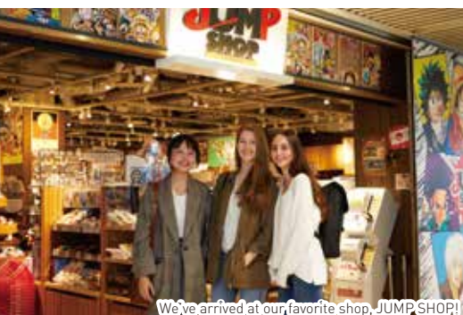
We've arrived at our favorite shop, JUMP SHOP!

Among the many shops, one that does its visual presentation extremely well is CANDY-A-GO-GO!. The shop assistants in their cute costumes, looking like they have just stepped out of their own little world, are very cool. Someone who captured the three girls' attention in an instant was JINSA, the very ostentatious fortune teller. The girls immediately had their fortunes told. I wonder what the future holds in store for them.