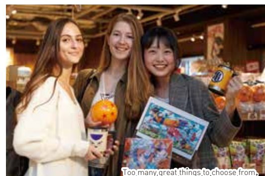
Too many great things to choose from.