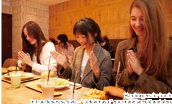
Hamburgers for lunch. In true Japanese style - “Itadakimasu!” gourmandise café and store

Finally, the girls made their way to the place they had most wanted to check out, JUMP SHOP. “Oh! Luffy!” “Gintama!” “Haikyū!” The girls were more than a little excited. JUMP SHOP is the official shop of the publishing house, Shueisha. It is packed to the rafters with merchandise from many of the popular manga series that have appeared in the weekly comic magazine, Shonen Jump. As well as comics, there is also original merchandise, T-shirts and other apparel, sweets, accessories, and zakka, all of it from the world of Jump manga. There are some JUMP SHOP exclusive items that can only be found here, and the girls’ voltage hit maximum power! Today, when the words “Kawaii” and “Manga” have leapt out of Japan and become a lingua franca of the world, the people who will support this world-class culture and turn it into something even more wonderful are none other than international students. “Nenzureba Tsüzü” This is an ancient Japanese proverb that means something like, “Wish it and it will happen.” As you continue your studies, keep your ambitions high and aim for your own field of dreams. All of us at OBKG sincerely hope to see your work on display in this shop one day in the not-too-distant future. Good luck! 🍀