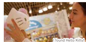
I found Hello Kitty!