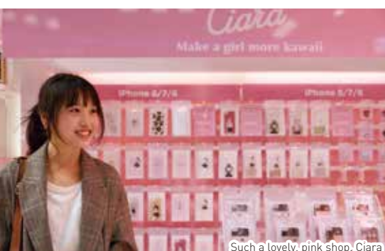
Such a lovely, pink shop, Ciara